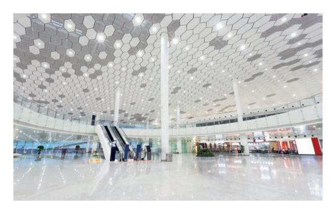
Retail/Shopping Malls over 100,000m<sup>2</sup> sponsored by